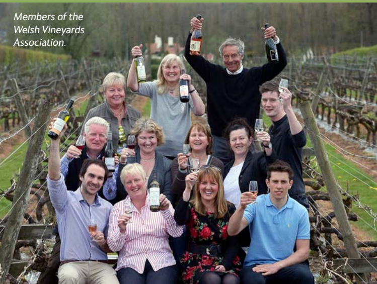
Members of the Welsh Vineyards Association.